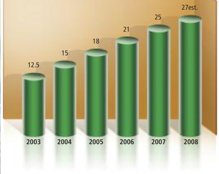
Turnover for R&M Williams (£millions)

Our performance in the construction industry has resulted in various awards from local authorities, industry groups and other contractors.